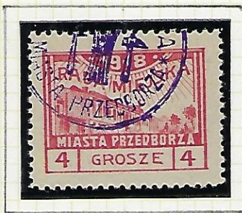
4gr red: Town Hall. Used (cancellation violet)