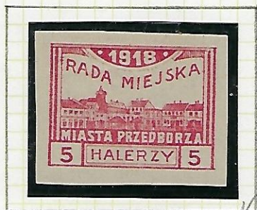
5h red: Market Square