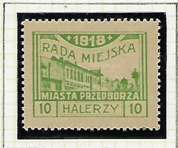
10 bright greens: Town Hall (Perf. 11½)