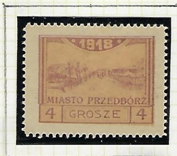
4gr violet and pale yellowish brown: Bridge across R. Pilica Perf. 11½ *