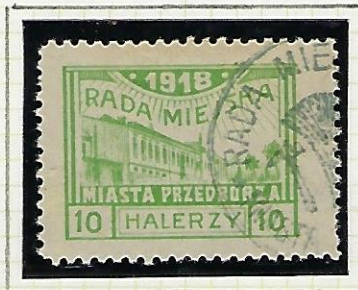
10h bright green: Town Hall (Perf.L.10)