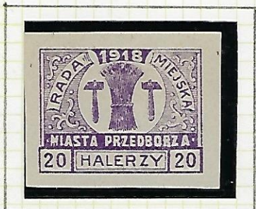
20h violet: Municipal Coat of Arms