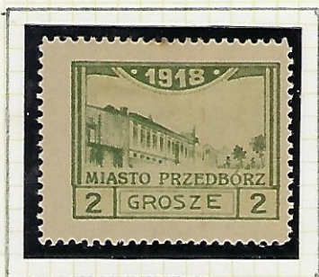
2gr olive-green and pale greyish green: Town Hall. Perf. 11½ *

26 Feb. 1918: Second Issue - Views of Przedbórz and Town's Coat of Arms. Four stamps printed litho by Zakład Pański in Piotrków Trybunalski, on medium, white paper. The 10gr (30.2 x 23mm) is slightly smaller than the others (30.7 x 23mm). Perf. 10 or 11½. Imperf. also exist (see next page)