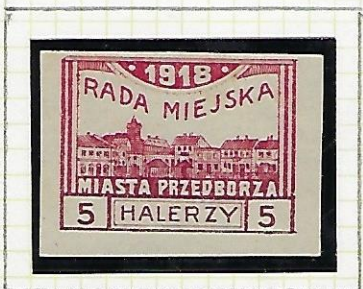
5h deep carmine-red: Market Square

(Not certified, but seems genuine: appears identical with certified copy above).