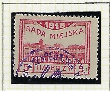
5h red: Market Square (Perf. 11½)

27 July, 1918: Fifth Issue - Same as Fourth Issue in Halerzy valuta, but with Sun Rays deleted . The 20 halerzy stamp is distinguished from the fourth issue by having a dot under the "A" of "MIEJSKA". Lithography, in sizes of 30 x 22.5 mm, as before. Perf. 10 or 11½, also imperf.