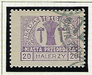
20h violet: Municipal Coat of Arms (Perf. L.10)