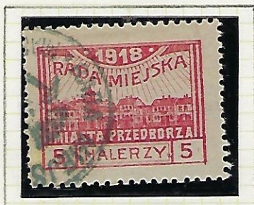
5h red: Market Square (Perf.L.10)

27 March, 1918: Fourth Issue - As before, but Valuta expressed in Halerzy instead of Groszy. Size 30 x 22.5 mm, as before. Printed litho by Zakład Pański of Piotrków Trybunalski on medium, white paper. Perf. 10 or 11½; also imperf.