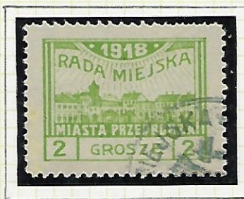
2gr green: Mi 7: double perforation at top. (Genuine; exp. Cereмуга)