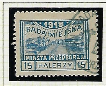
15h blue: Pilica River Bridge. (Perf. L.10)