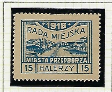
15h blue: Pilica River Bridge. (Perf. 11½)