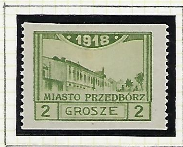
2gr: missing perforation (11½) at top and bottom.