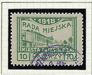
10h: bright greens: Town Hall (Perf. 11½)