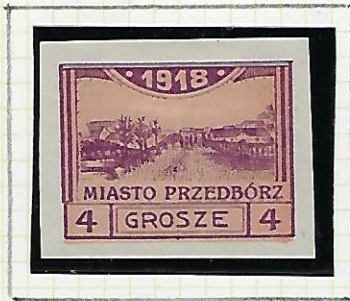
4gr violet and pale yellowish brown: Bridge across R.Pilica.