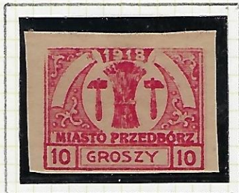
10gr imperf. with considerably darker shade, and lines disappeared at stamp's top. Not a proof.