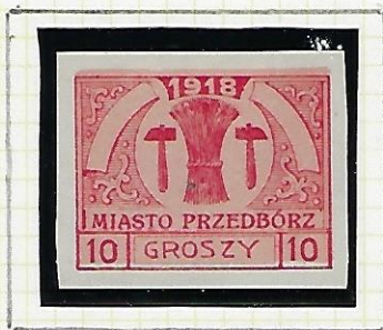
10gr red and pale flesh - coloured: Town's Coat of Arms.