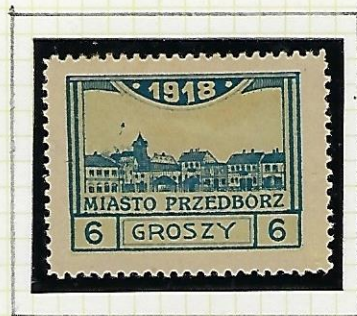
6gr blue and pale yellow-green: Market Square Perf. 11½ *