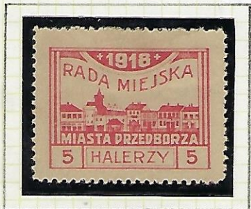
5h red: Market Square (Perf. 11½)

"+1918+" (crosses instead of dots in the 5, 10 & 15h) in this cheaply offered set.