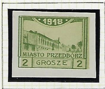
2gr olive-green and pale greyish green: Town Hall.

26 Feb., 1918: Second Issue - Imperforate . Genuine: Ceremuga.