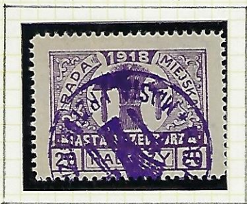
20h violet: Municipal Coat of Arms (Perf. 11½)