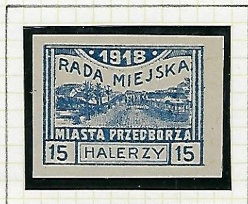
15h blue: Pilica River Bridge.