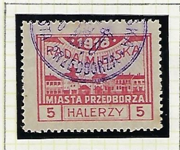
5h red: Market Square (Perf. 11½)