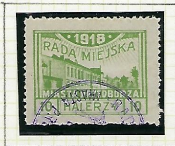
10h bright green: Town Hall (Perf. 11½)