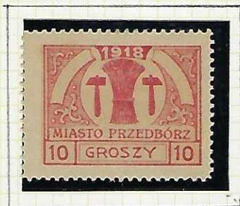
10gr red and pale flesh-coloured: Town's Coat of Arms. Perf. 11½ *