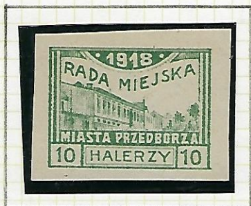
10h bright green: Town Hall