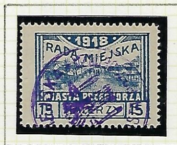
15h blue: Pilica River Bridge. (Perf. 11½)