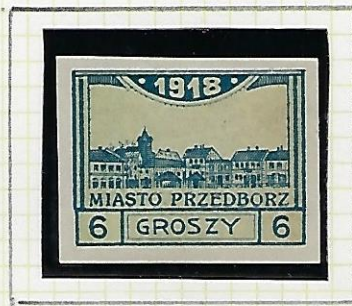
6gr blue and pale yellow-green: Market Square.