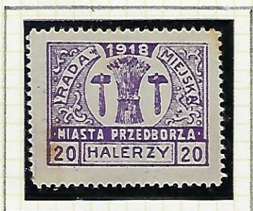
20h violet: Municipal Coat of Arms (Perf. 11½)

No dot under A. (maybe genuine, from 4th issue?)