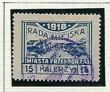
15h blue: Pilica River Bridge. (Perf. 11½)