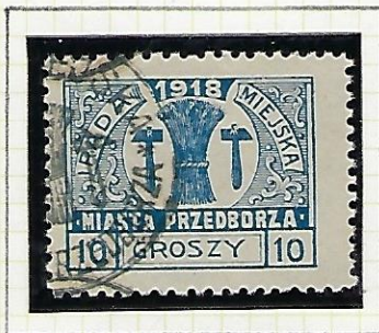
10gr blue: Town's Coat of Arms Used (cancellation black)