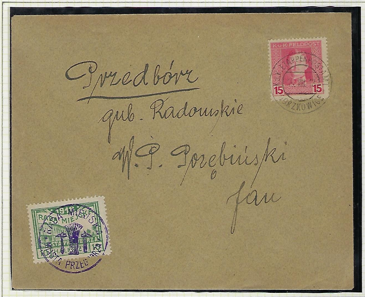
Letter posted at Gorzkowice on 16th August 1918, delivered to Przedbórz via the Austrian military Post Office at "Konsk" using local post, extra post paid by a 10 Heller (fifth issue) stamp cancelled by a Przedbórz local postmark.

A branch of the Austrian Post Office existed at Przedbórz, but civilian mail was dealt with by "Konsk" (= Końskie, 39 km E.N.E. from Przedbórz). From there, mail for Przedbórz was dispatched by local post, under the Austrian Post Office.