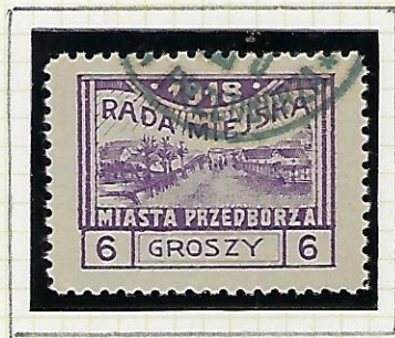
6gr violet: Pilica R. Bridge. Used (cancellation blue)