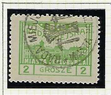
2gr green: Market Square. Used (cancellation black)

15 March, 1918: Third Issue - Changed Views and Coat of Arms. Also new inscription "RADA MIEJSKA / MIASTA PRZEDBORZA" ("Town Council / of the Town of Przedbórz"). Four stamps printed litho by Zakład Pański in Piotrków Trybunalski on medium, white paper. All stamps 30 x 22.5mm. Line perf.10, but imperforate also exists.